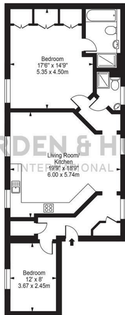
First Floor For Illustration Purposes Only - Not To Scale

This floor plan should be used as a general outline for guidance only and does not constitute in whole or in part an offer or contract. Any intending purchaser or lessee should satisfy themselves by inspection, searches, enquiries and full survey as to the correctness of each statement. Any areas, measurements or distances quoted are approximate and should not be used to value a property or be the basis of any sale or let.